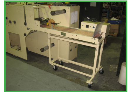
With Mark Andy 2200 & Stacker