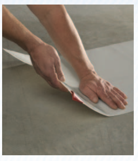
smooth floor surface by pressing firmly in place.