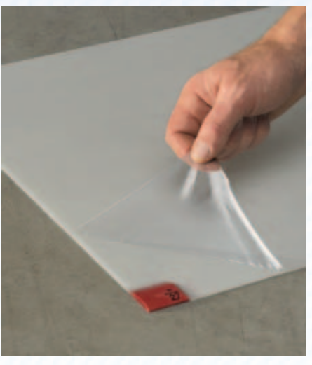
3. Peel off top clear protective layer from the red tabbed corner to expose first sheet. Mat is now ready for use.