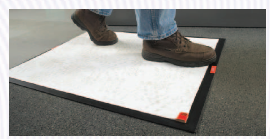
Nonskid backing keeps mat in place